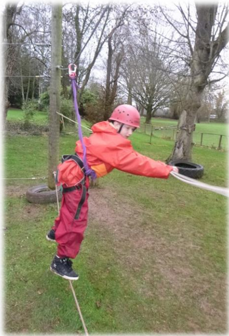
Year 8 Residential Visit to Glasbury