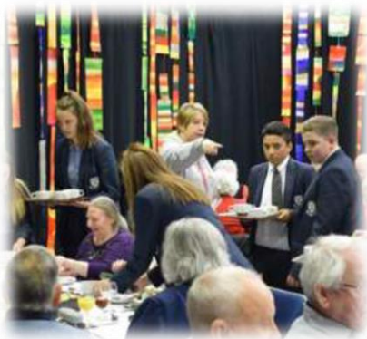
Senior Citizens' Christmas Party