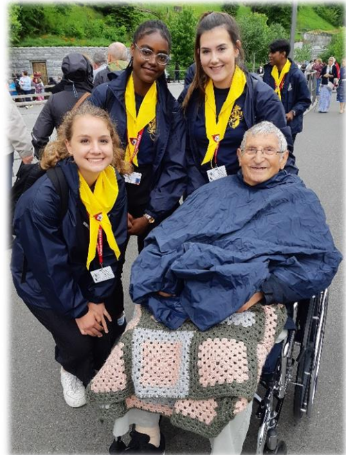
Annual Pilgrimage to Lourdes