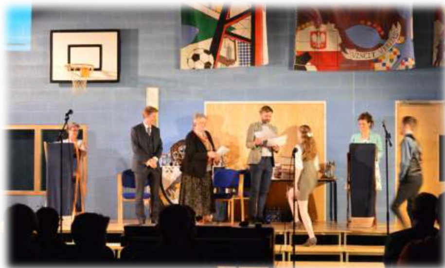
BGN Prizegiving Evening

We want our students to feel proud of themselves and the school through their achievement. At BGN we acknowledge that positive recognition of students encourages appropriate behaviour, increases self-esteem, creates a positive learning environment, and establishes positive relationships within the classroom.