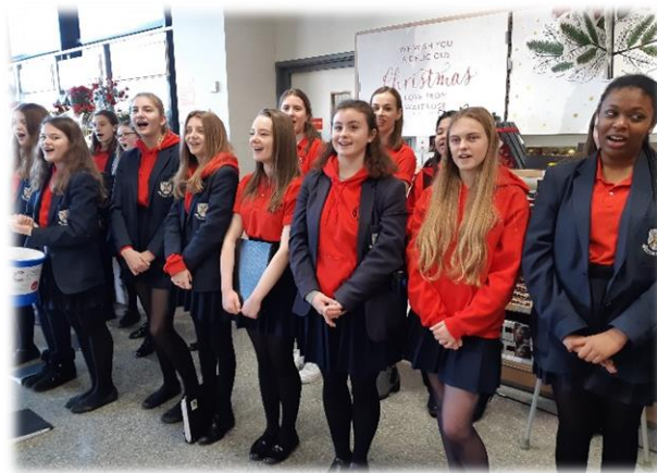
Fundraising by the School Youth Choir

Breast Cancer Lourdes Fund 2020 – Trip cancelled due to COVID Poppy Collection (Direct to British Legion) CAFOD Fr Hudson's Brodey Centre, Banbury Readathon