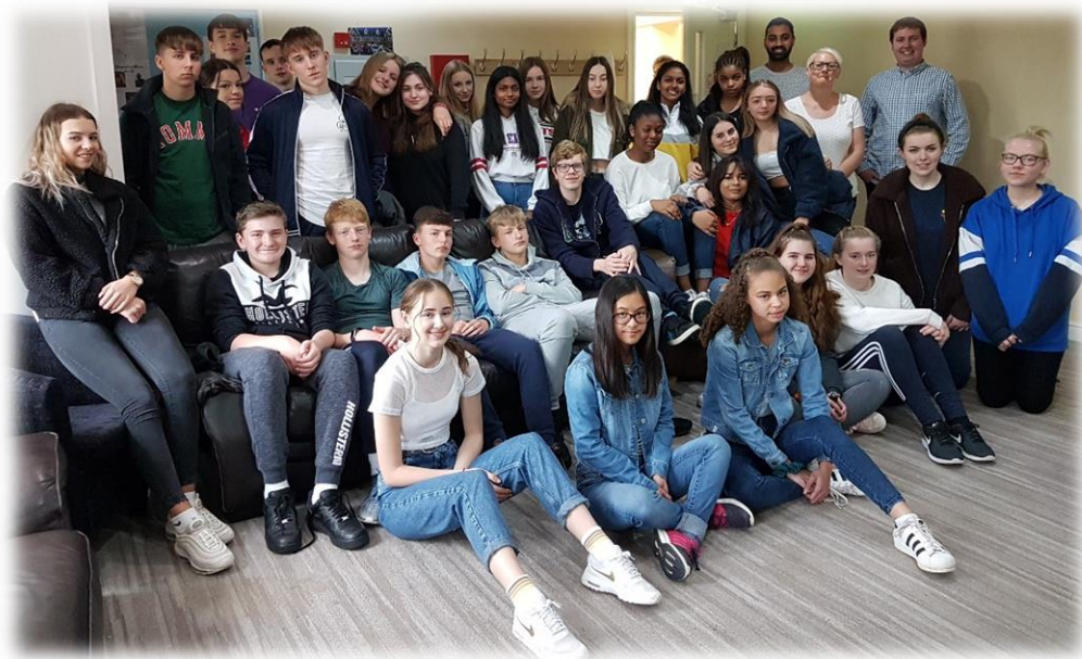
Year 10 Soli House Spiritual Retreat

Our most recent Ofsted report stated that ‘The school makes an exceptional contribution to pupils’ personal, spiritual, moral, social and cultural development.’