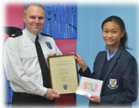
Banbury Police "Safeguarding Children in Banbury" Initiative